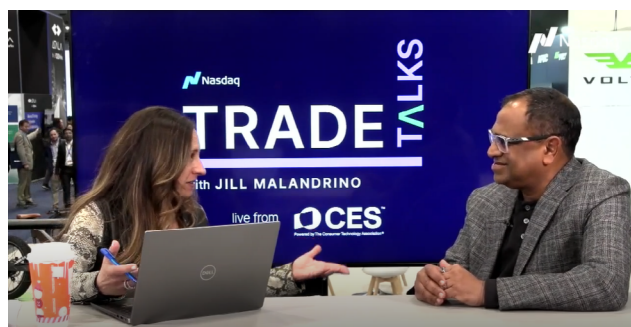
Powering the Technologies of the Future With Disruptive Battery Architecture

The top milestones we identified at the beginning of 2024 were achieving SAT for agility and our high-volume manufacturing lines in Malaysia and delivering samples of our leading smartphone batteries, EX-1M and EX-2M, to customers. Not only did we hit these top milestones, we also advanced relationships with market leaders in smartphones, AR/VR, and automotive industries. We believe that these relationships, supported by purchase orders and commercial launch schedules, provide a clear path for us to commence mass production in 2025.