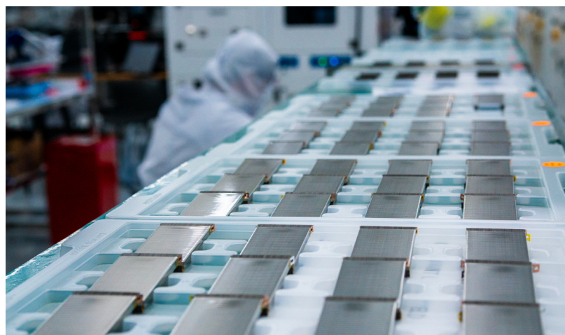
Enovix Fab2, Penang Malaysia